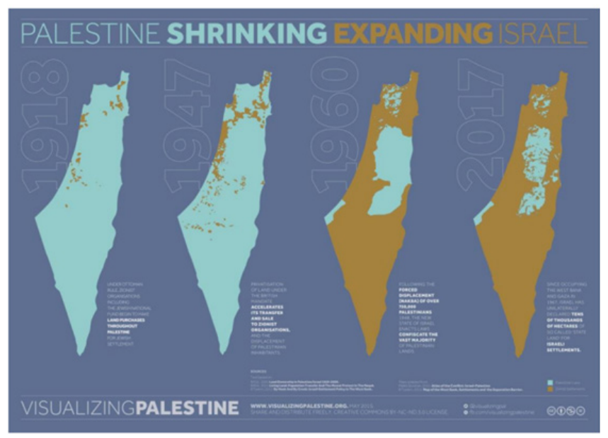
Fig. 1. Map of Israel and State of Palestine.

the violence, the Israeli government has implemented a Jewish settlement initiative and a system of roadways exclusively for Jewish use (Harms & Ferry, 2017). This has led to the relocation of 5.7 million Palestinian refugees (UNRWA, 2021). The United Nations asserts that Israel's building of settlements in the Palestinian areas occupied since 1967 constitutes a violation of international law. Figure 1 below illustrates the expansion of Israeli territory.