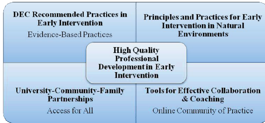
Figure 1. Foundation for High Quality EI Services