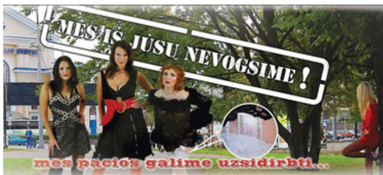
Fig. 3 A poster of TPP political party

The same topic was addressed a few years ago in a series of electoral posters of Lithuanian TPP party 23 , where the business metaphor was ironically exploited in a similar way. The underlying conceptual metaphor of POLITICS IS BUSINESS is further elaborated into POLITICS IS A DIRTY BUSINESS / A CRIME , or to be more specific, the posters played around the common belief that politicians steal from the country, from the people. POLITICS IS THEFT is the conceptual metaphor that is dominant in ironic communication in article commentaries but rare in articles or article headlines as such statements might be considered libel and the authors might be sued. Yet, being common in everyday discourse, the ironic metaphoric reference was also visualized in the electoral campaign of the TPP political party in 2008 24 . Having been continuously accused of stealing (from European funds, from the budget, from common citizens) the politicians deliberately exploited the reference ironically in their pre-election posters: