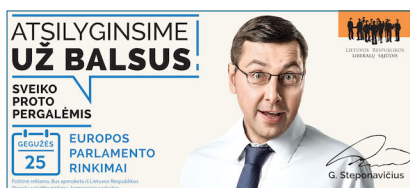
Fig. 2. A poster of the Liberal Party

Many cases of the metaphorical POLITICS IS TRADE ( POLITICS IS BUSINESS ) irony are visualized. The visual ironic metaphor was used as one of the main election posters of the Liberal Party in 2013 21 . The slogan Atsilyginsime už balsus ( We will pay back for your votes ) echoes a well-known case of political parties "buying" the votes from the electorate of marginal social groups: prisoners, alcohol or drug addicts, etc. Here the party plays on words – the phrase "we will pay back for your votes" is instantly recognizable, however, in later posters the further elaboration of the statement gives a different shade of meaning as the party promises to pay back in the currency of the victories of common sense. Such linguistic game can be seen as the case of trumping games in the meaning of Veale 22 , and the irony of the statement becomes explicit as the speaker looks with irony at the electoral body that assumingly believed the metaphorical promise of paying back.