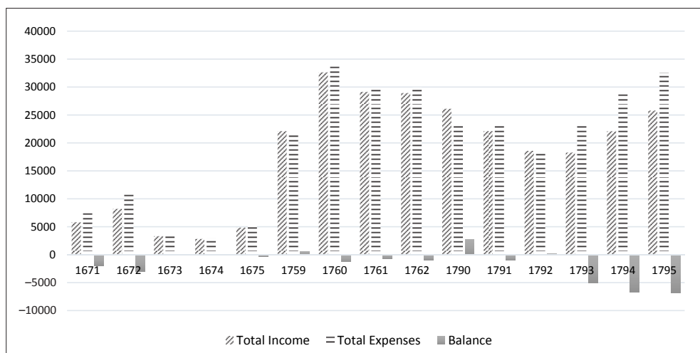
Figure 2. The income and expenses balance of Vilnius Franciscans for the years 1671–75, 1759–62 and 1790–95 (in zł).

this was due to the inflation, as more studies need to be devoted to the latter, but it seems that at least some part was due to the increased economic activities of the Franciscans, especially in the spheres of alcohol sales and financial activities. How does the Franciscans' turnover compare with other economic agents in the city at the time? The Franciscans could be compared with the individual richest urban citizens, 45 but the Vilnius Cathedral Chapter did manage a yearly revenue that was at least twice bigger. 46 What is also visible from the balances is that how often they were negative or neutral. The exact reasons for this are unclear, but it could indicate a reluctance to save or a preference to use income in the local economic landscape (for example, by employing more local laborers and other services), as was suggested in their theoretical approach in the first section of