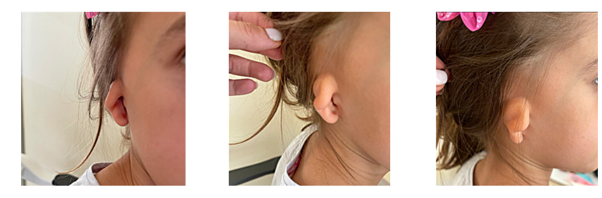
Figure 1. Initial status

6 year old girl had constricted ear grade IIB by Tanzel, on her right ear: decreased ear size, lop deformity (folded forward and down) and protrusion (Figure 1).