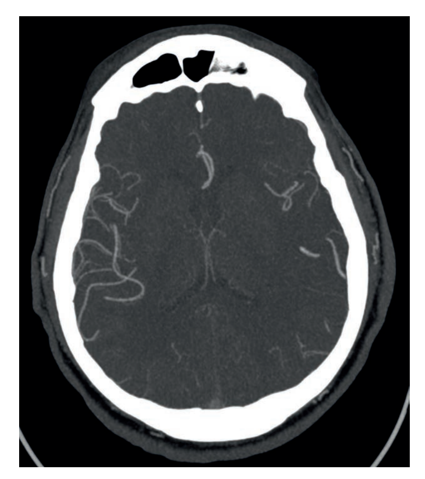
Fig. 3 Head computed tomography scan showing a cerebral infarction in the left middle cerebral artery territory with occlusion and impaired distal blood flow

Stroke is the second most frequent cause of death worldwide [14,15]. In-patient mortality rates from stroke range between 5% and 15% [16]. Cardioembolic cerebral infarction is associated with higher mortality as compared to other stroke types [10,17]. In the recent decades, the mortality of stroke is also decreasing due to healthcare improvements [2,14].