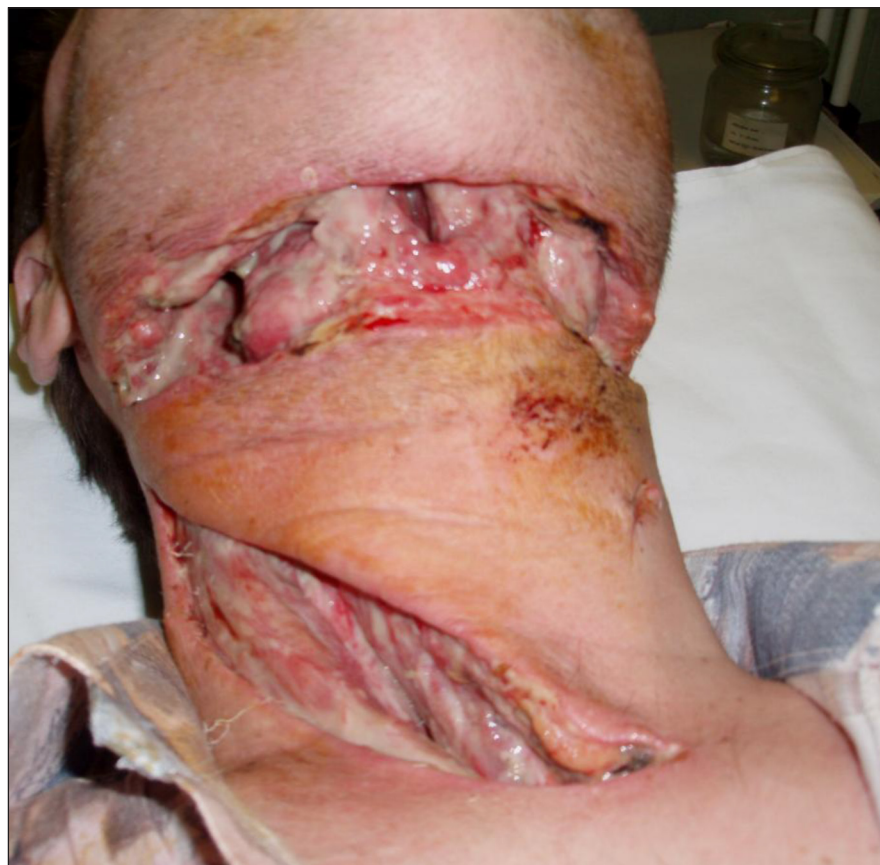
Fig. 2. Postoperative view of the cervical and submandibular area (7 days after incisions) in the patient with DNM (case 44)

of symptoms and the first admittance to hospital varied from 0 to 14 days, the median was 7 days (QR: 4–8).